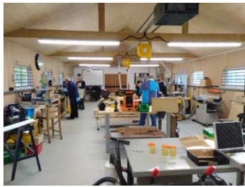
Shedders starting to work on projects

Our biggest project has been building and kitting out our new shed. Its been a real experience and made all the better by doing it with some good friends and a very driven committee.