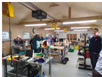
Shedders working away ...