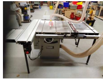
Table saw and router table ...